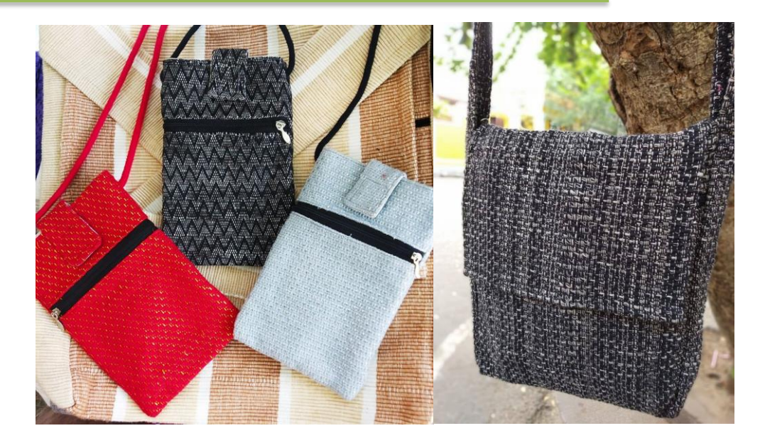
Photo: Sling bags stitched from snehan Tailoring Center which started in first quarter of the year

Snehan's, Jhola Bags, made out of strong export cotton material. The fancy sling bag can be used by college students, office staffs to carry books and laptops. The Eco-friendly bag is durable and washable. The bags are made in different sizes in hundreds of colors. The core mission of the snehan is to empower deprived by providing livelihood and dignity of life. Bags stitching is one of our operational strategies to achieve our mission.